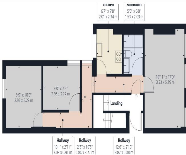
Floor 1 Building 1